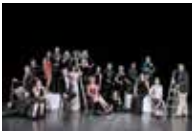
Colorado State University Clarinet Studio

27 PERFORMANCE THE SOLAR FLAIR FESTIVAL - RECITAL IN THE MUSEUM Saturday, April 27, 2019 3 P.M. Pre-concert Talk 4 P.M. Recital In collaboration with the Department of Music at CSU