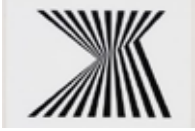
Bridget Riley Untitled (from "Fragments"), 1965

22 EXHIBITION OFF KILTER, ON POINT: ART OF THE 1960s FROM THE PERMANENT COLLECTION January 22 – April 13, 2019 The Griffin Foundation Gallery