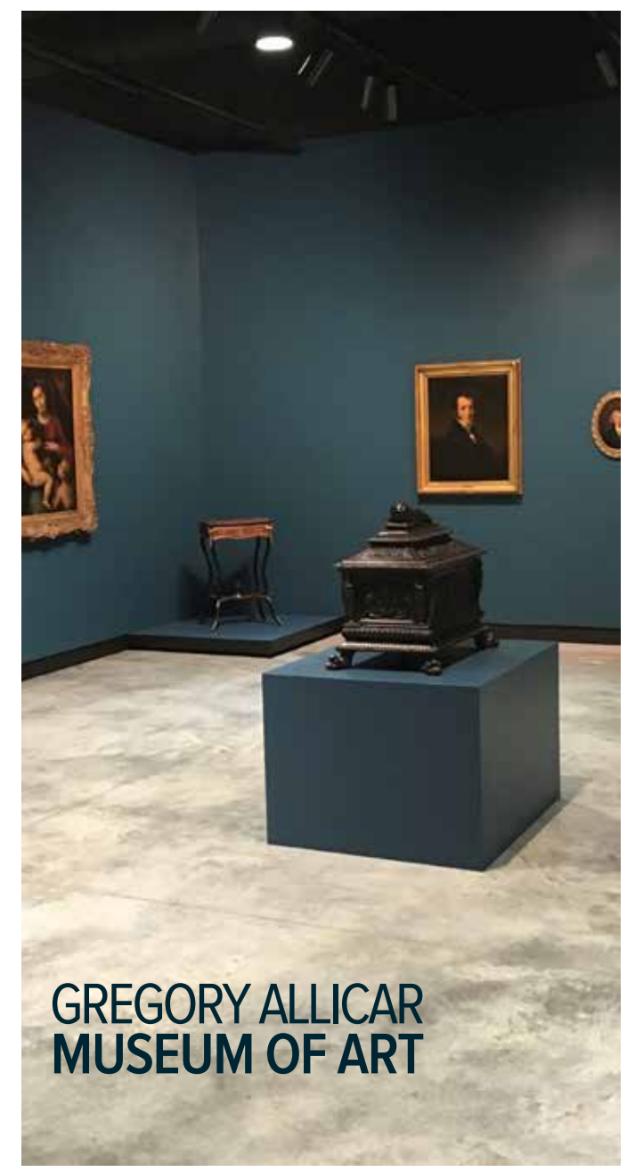
Hartford-Tandstad Exhibition Gallery installation in progress.

The Gregory Allicar Museum of Art (formerly the University Art Museum) with a growing and diverse art collection, expanded facilities, and dynamic on-and off-site programming, is a cornerstone of Colorado State University's arts initiatives and a link to alumni, Fort Collins, and our region.